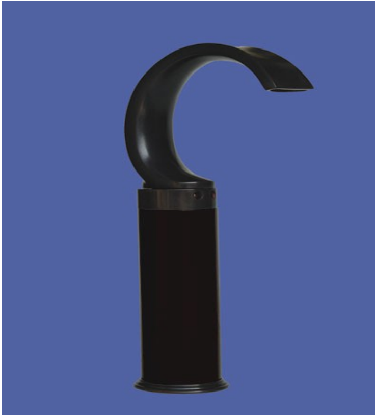
Autoluxe™ Model: FA400-136

Autoluxe Faucets Are Available In Twenty Finishes