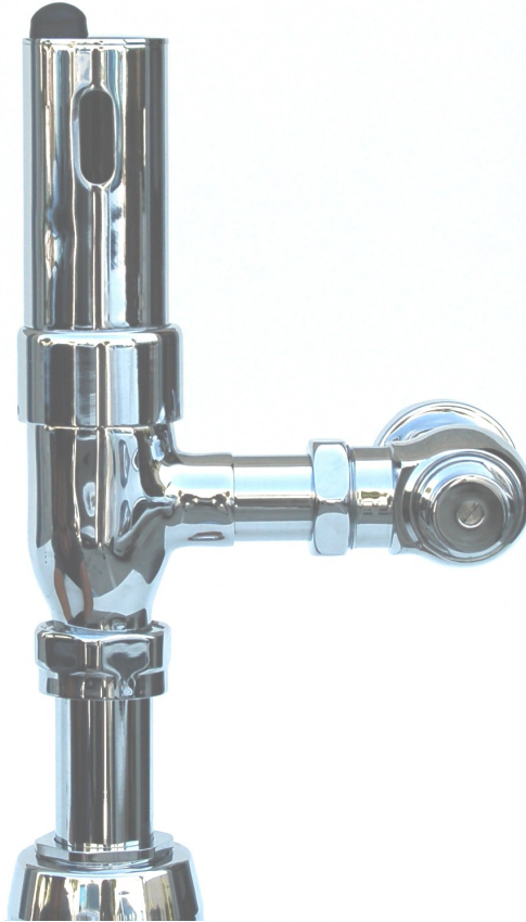
Model: ATV-2 Complete Valve

Model: ATV-2B Flush Valve Only (Retrofit Applications for Sloan, Zurn, Toto)